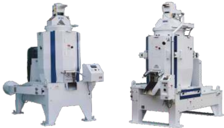
VTA7SR-T VTA9SR-T VTA12SR(2)-T